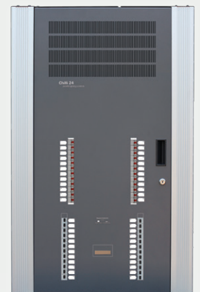
Dimensions: 1000 (H) x 632 (W) x 155mm (D)