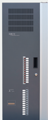
Dimensions: 1000 (H) x 400 (W) x 155mm (D)