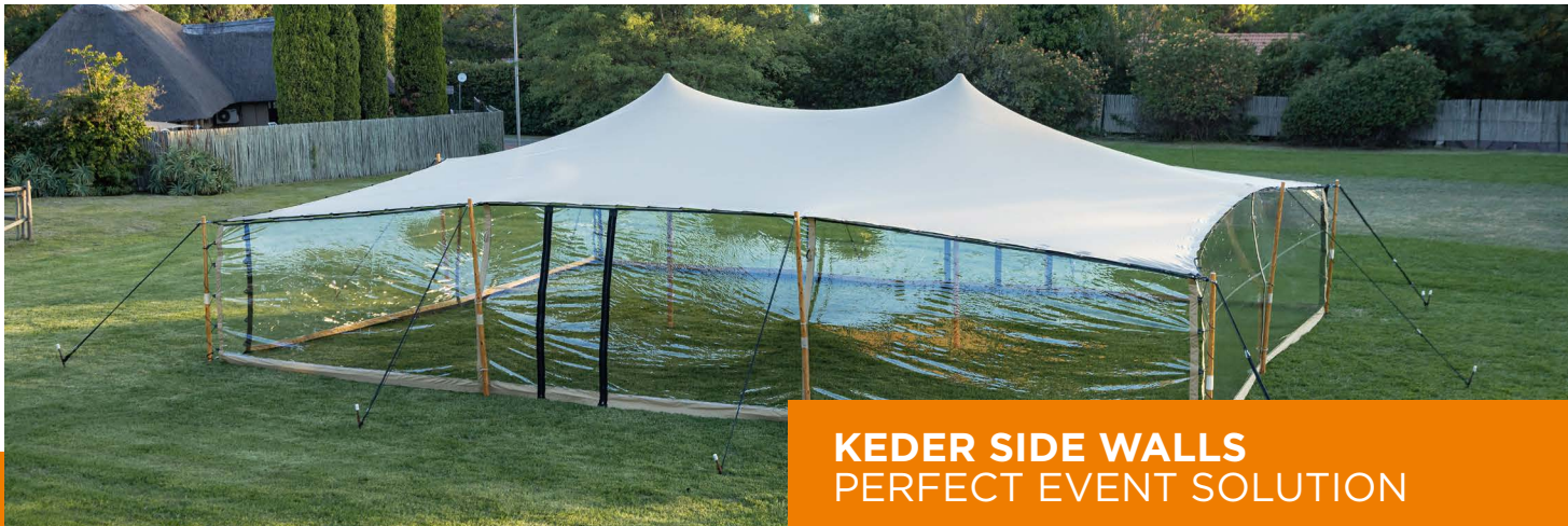
KEDER SIDE WALLS PERFECT EVENT SOLUTION