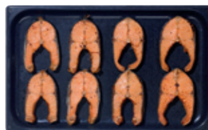
GN 1/1 crosswise insertion

Your benefits: a huge plus in capacity as well as increased productivity. Our flexibility concept speeds up all of the various processes in professional kitchens. And you not only save time, but valuable energy as well.*