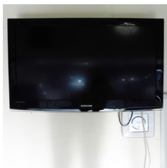
Samsung DV3 HD SRS 37" Flat Screen TV