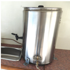
Burco BCO 29L Hot Water Urn