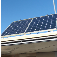
4 x Photovoltaic Roof Panels