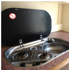
SMEV Twin Hob Gas Cooker & Single Basin Sink