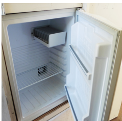
Beko MR53 Refrigerator