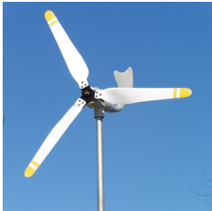
FD.2.5-300 Solar Wind Turbine