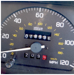
Under 19,000 miles on clock