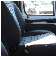
Excellent condition cloth leather cab seating