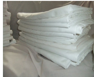
10 PLAIN CLOTHS TO COVER 6' TABLE