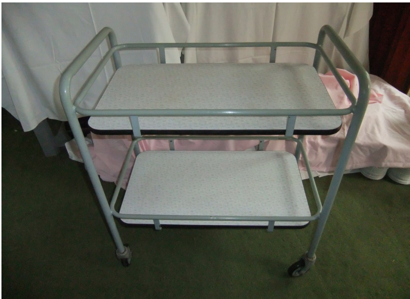
2TIER METAL FRAME TROLLEY