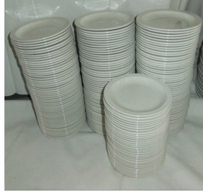
190 x 6" side plates