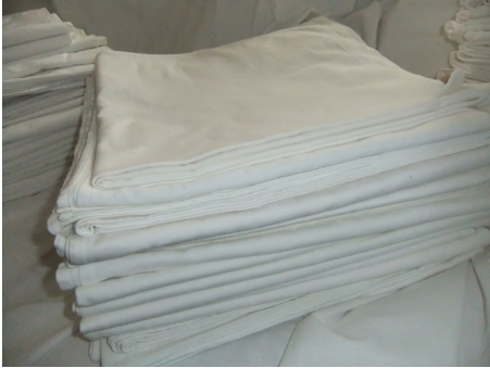
16 IVY LEAF CLOTHS TO COVER 5' DIA TABLE