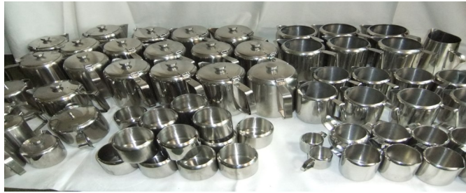
TEAPOTS—1 large, 3 medium, 8 small COFFEE POTS— 16 6 large, 8 medium, 12 smaller open jugs 16 sugar bowls