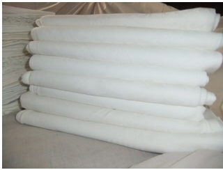
8 IVY LEAF CLOTHS TO COVER 4' TABLE