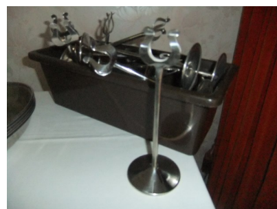
20 table Number Stands