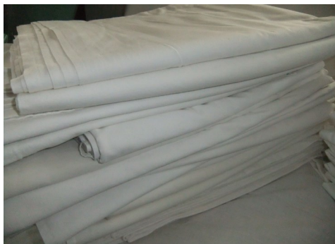
20 CLOTHS SUITABLE FOR TRESTLE TABLES