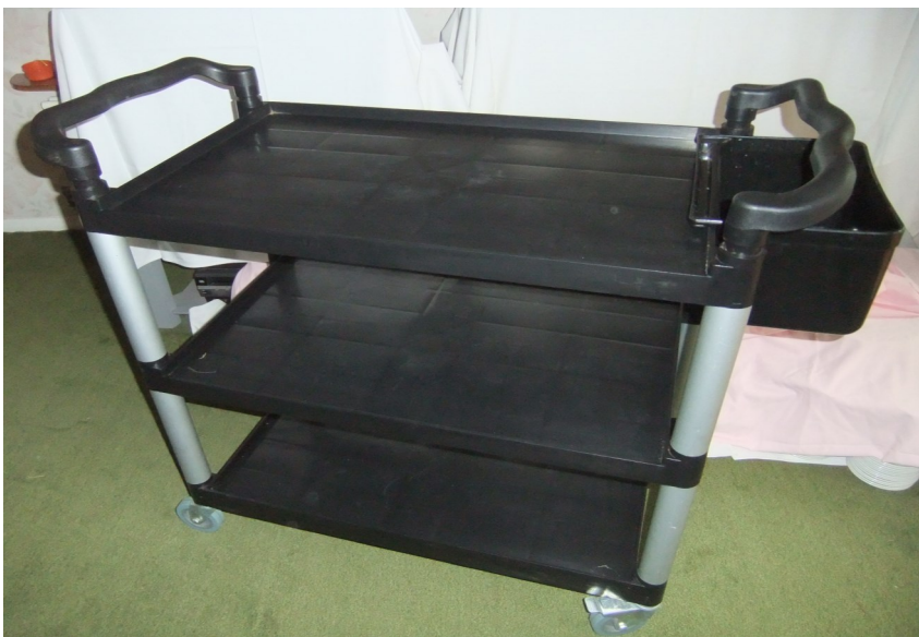
PLASTIC 3 TIER CLEARING TROLLEY AND CUTLERY BOX