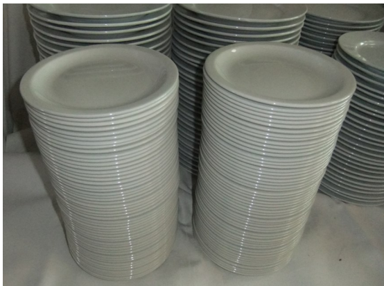
100 x 8" tea plates