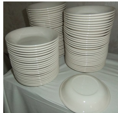
80 x 7.5" soup plates