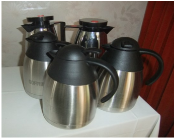
5 Vacuum Jugs 2 plain 2 coffee 1 Tea