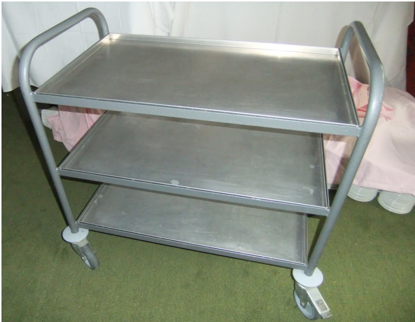
STAINLESS STEEL 3 TIER CLEARING TROLLEY