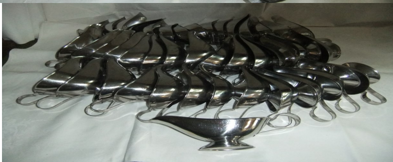
42 Gravy Boats