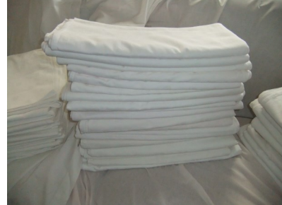
18 IVY LEAF CLOTHS TO COVER 6' DIA TABLES