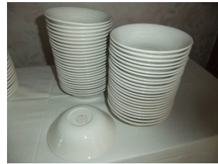
50 dessert bowls