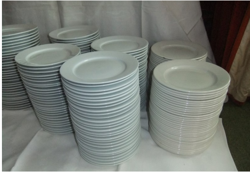
180 x 9" dinner plates