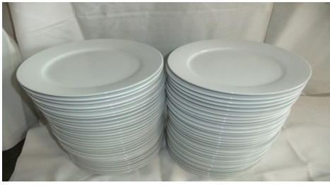
60 x 10" dinner plates